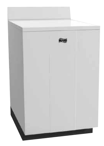
Table Top Water Heater

Units meet or exceed ANSI requirements and have been tested according to D.O.E. procedures. Units meet or exceed the energy efficiency requirements of NAECA, ASHRAE standard 90, ICC Code and all state energy efficiency performance criteria.