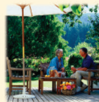
Renovations, Additions and Vacation Homes