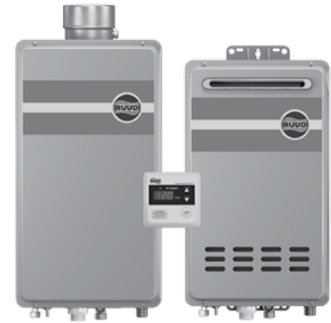
RUTG-DVL RUTG-XL Indoor DV Outdoor 11,000-199,900 Btu/h Natural and LP Gas

See Warranty Certificate for complete information