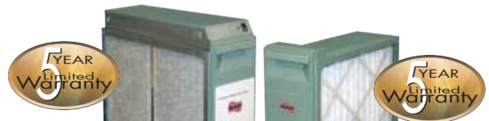
Ruud Electronic Air Cleaner

540015 24" Furnace Exact Fit MERV 10 Replacement Filter