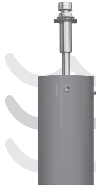
Warrior DV 30-, 40- and 50-Gallon Capacities

Units meet or exceed ANSI requirements and have been tested according to D.O.E. procedures. Units meet or exceed the energy efficiency requirements of NAECA, ASHRAE standard 90, ICC Code and all state energy efficiency performance criteria.