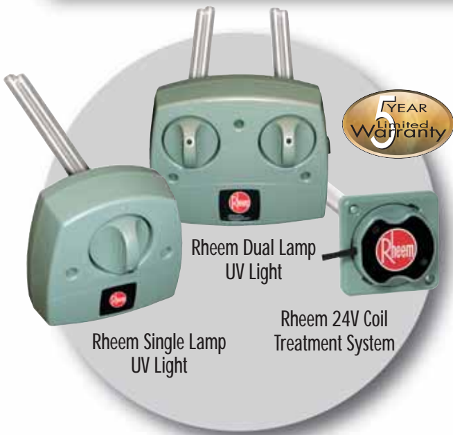
Rheem Single Lamp UV Light