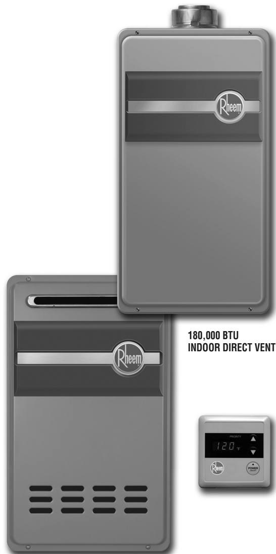
180,000 BTU INDOOR DIRECT VENT

With Rheem's new conversion kit, our 66 tankless series can now be converted to COMMERCIAL!