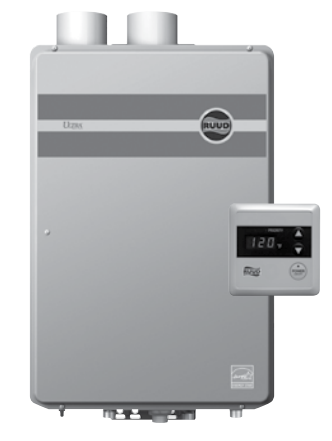
RUTGH-DV Indoor Direct Vent Model 11,000-199,900 Btu/h Natural and LP Gas

* Based on simultaneous showers using 2.5 gallons per minute. Flow rates vary depending on temperature of cold water supply.