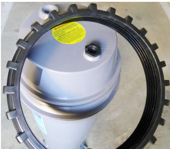
Figure 2. Lock Ring Removed

NOTE: if negative pressure inside persists, it may be necessary to drain the tank in order to remove the lid.