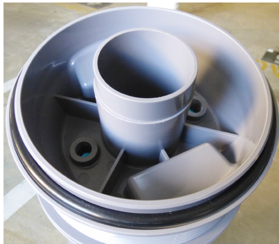
Figure 4. O-Ring Positioned