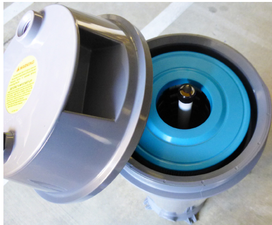
Figure 3. Lid Removed