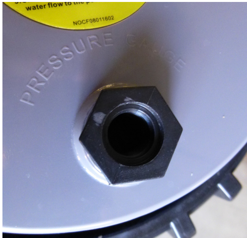
Figure 1. Pressure Release Valve