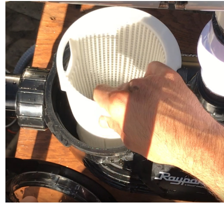
Figure 3. Lint Basket Removal