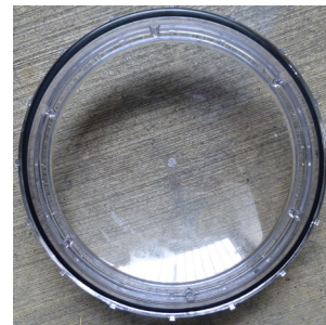
Figure 5. O-Ring Mounted