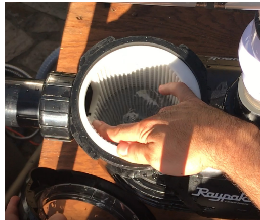
Figure 4. Lint Basket Guide Keys