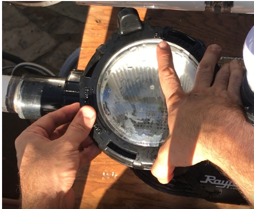
Figure 1. Lock Ring Removal - Rotational Direction