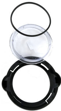
Figure 2. Parts Separation