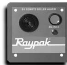
Optional Remote Alarm Panel

Raypak, Inc. reserves the right to make product changes or improvements at any time without notification.