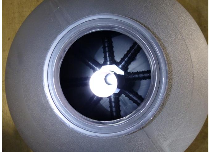
Figure 2. Lateral Assembly Installed into Tank.

NOTE: Lateral arms have locking notches to ensure solid attachment. It may be necessary to use curved jaw tongue-and-groove pliers to turn the lateral arm. Use caution to avoid crushing.