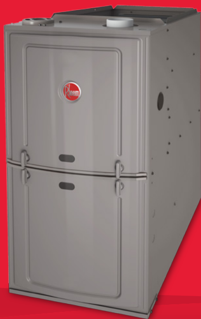
Classic® Series R801S / R801P

We took it a step further and delivered “PlusOne™” advantages – unique Rheem innovations designed to make your job easier while providing homeowners with the ultimate home comfort experience.