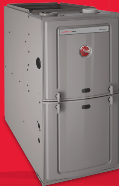
Classic Plus™ Series R801T / R802P