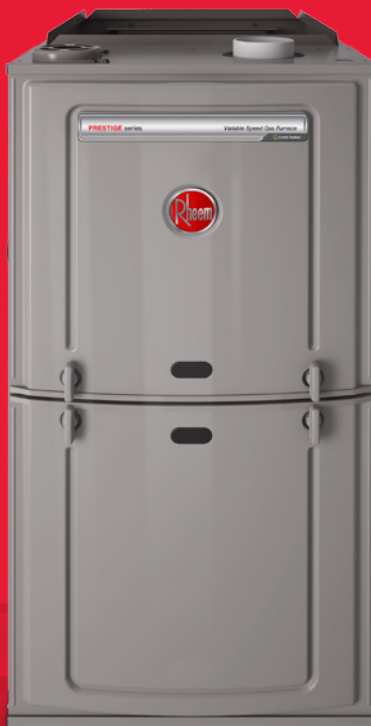
Prestige™ Series R802V